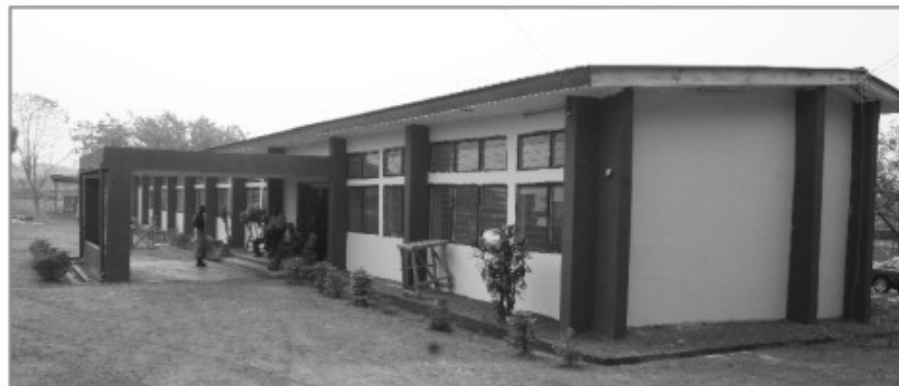
The new look Enugu Zonal office.

The building to the back of the main office complex is meant to accommodate the Transport, Administration, Legal and Media offices as well as the staff canteen.