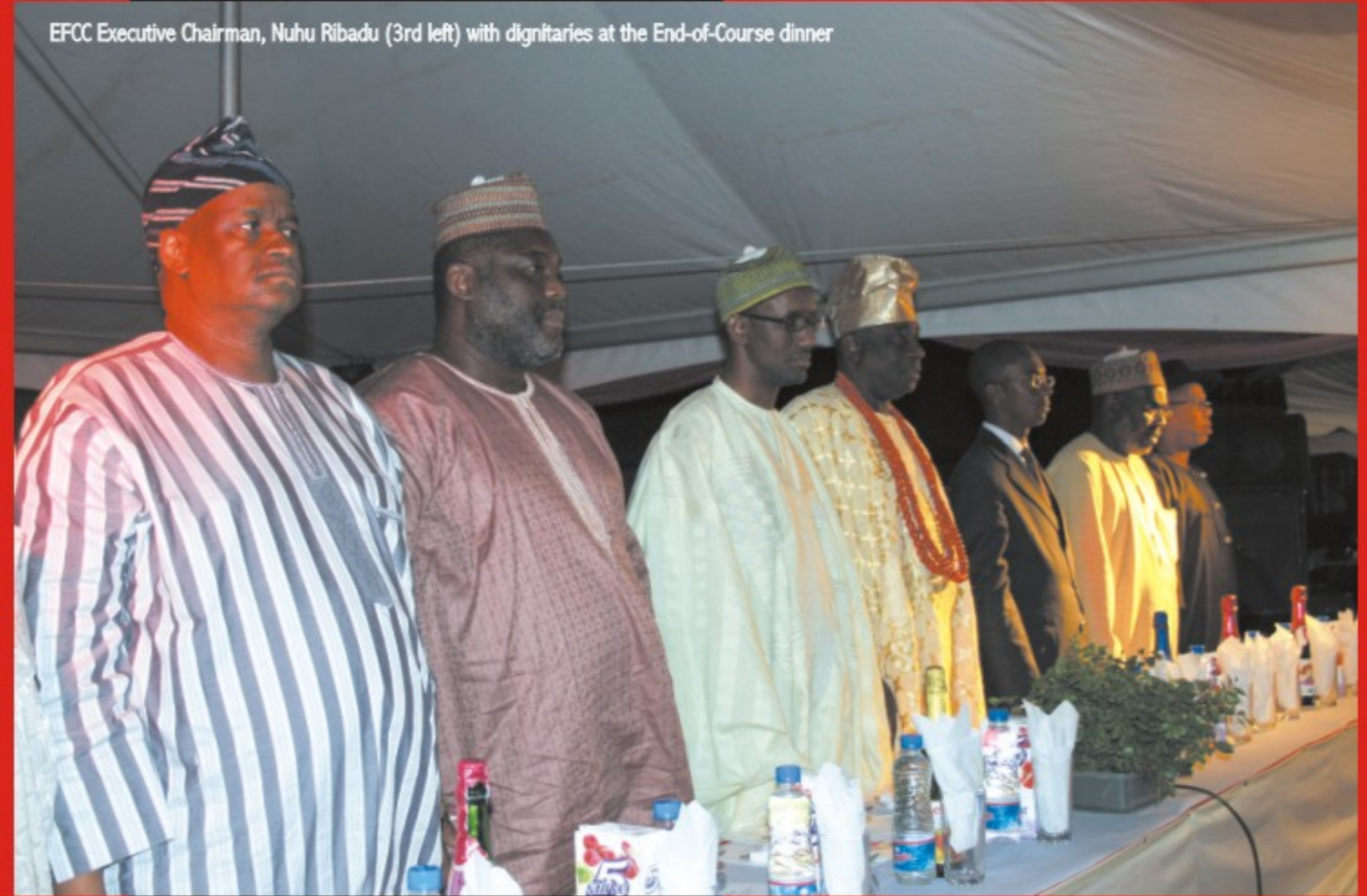
EFCC Executive Chairman, Nuhu Ribadu (3rd left) with dignitaries at the End-of-Course dinner