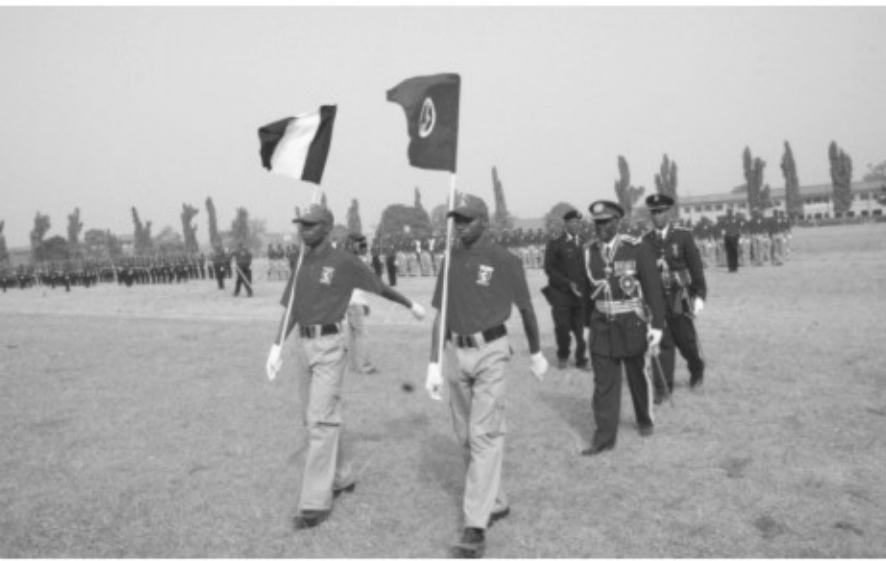
Chief of Defence Staff, Gen. Martin Luther Agwai, during the passing out parade.