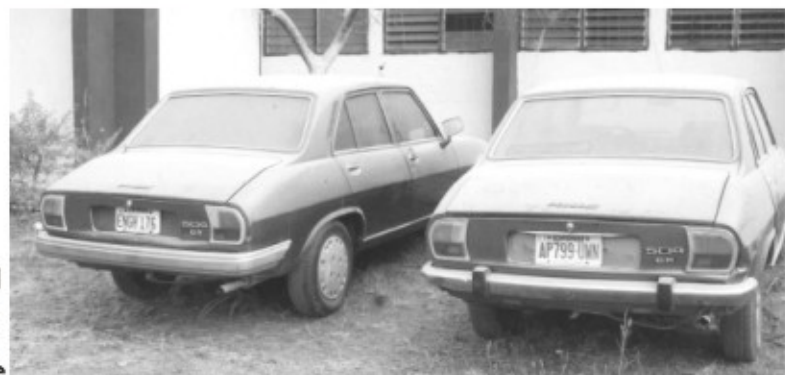
Impounded vehicles at the Enugu Zonal Office