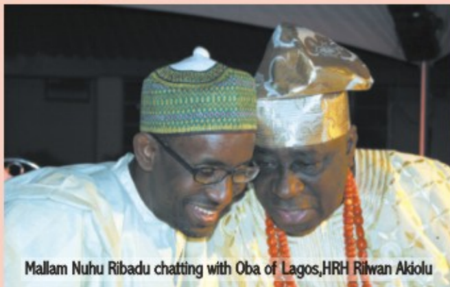
Mallam Nuhu Ribadu chatting with Oba of Lagos, HRH Rilwan Akiolu