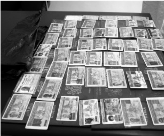
Various Driving Licences seized from the ladies.