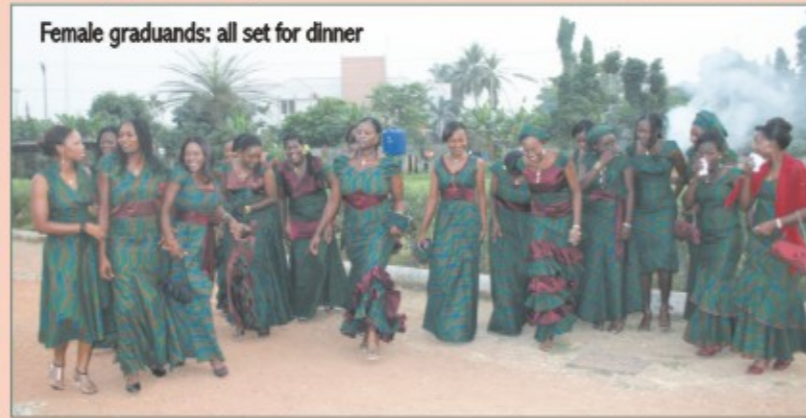
Female graduands: all set for dinner