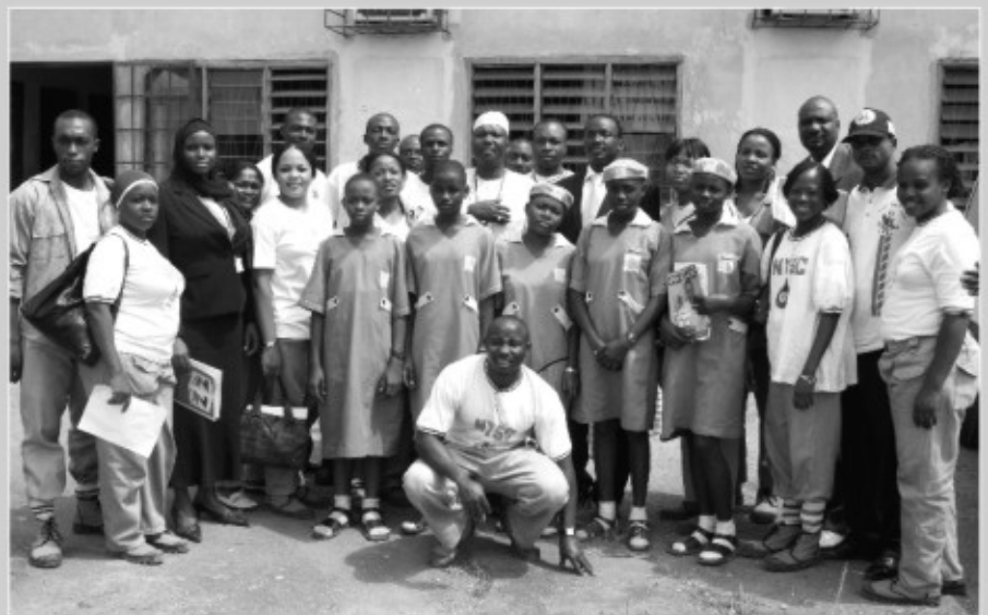
Members of the NYSC Anti-Corruption Group with EFCC & ICPC officials and secondary school pupils