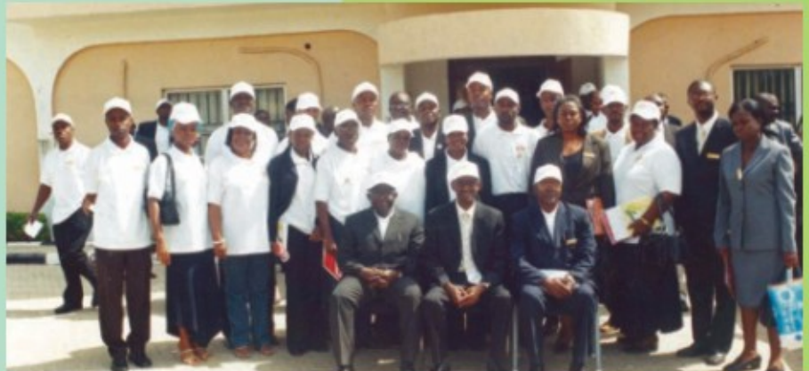
EFCC's SERVICOM Committee members after inauguration in Abuja.

SERVICOM was simple: "you have the right to be served right." He emphasized that the right to be served right comes first as citizens of Nigerian.