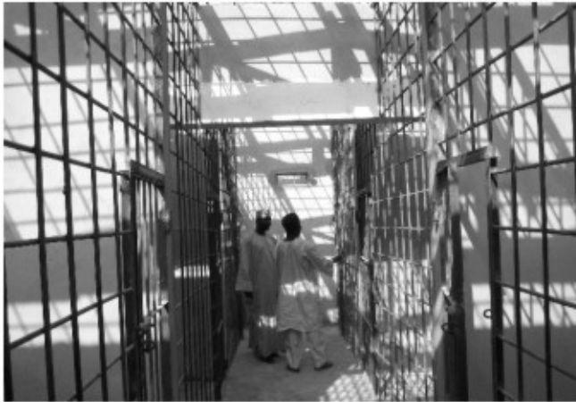
Top & bottom: Renovation of Kano Zonal office.